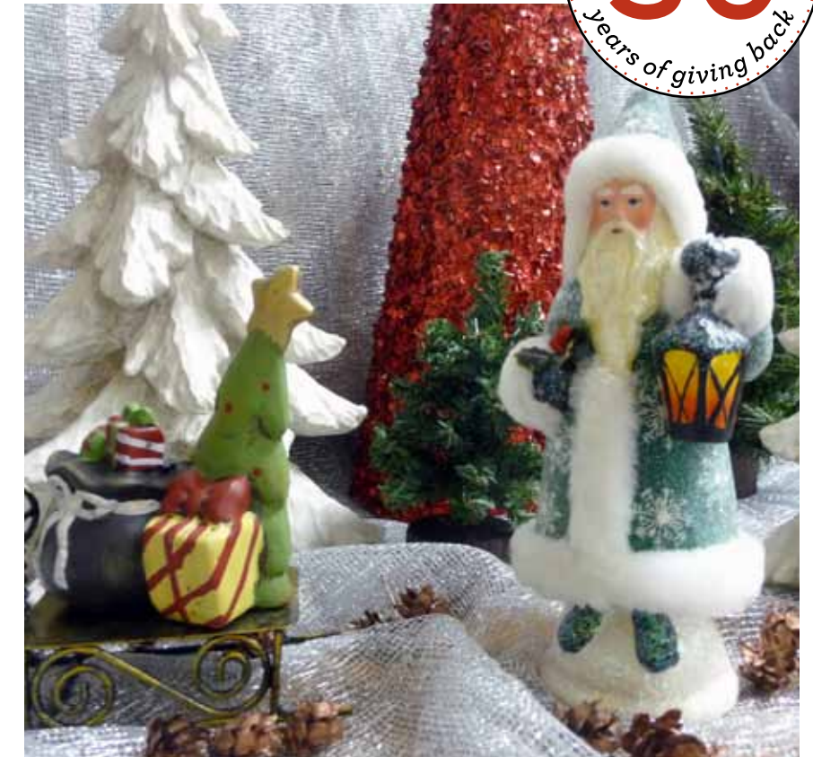
Make your home a winter wonderland with decorations from Kerr Gift Shop.