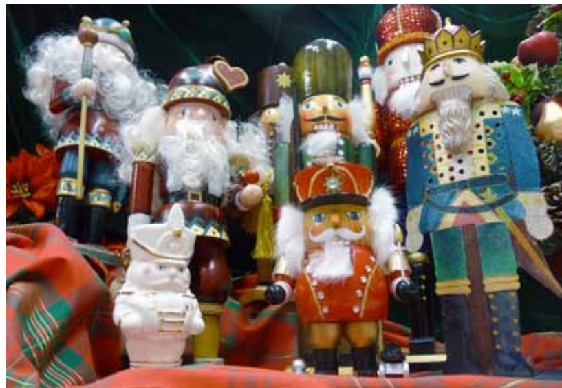
Top: Brighten up a friend's day with a sparkling gift from Kerr's Economy Jar. Bottom: Kerr Thrift Shop has an assortment of nutcrackers to grace your holiday display this year.

Call 503-231-0216 to make your holiday reservations today, space is limited.